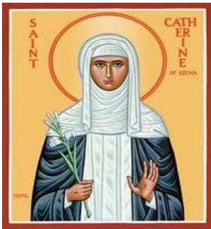
St Catherine of Siena