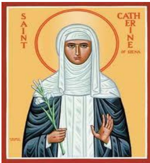
St Catherine of Siena